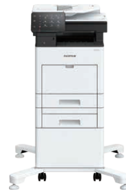
Main unit + 550-Sheets Feeder x1 + Cabinet