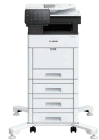
Main unit + 550-Sheets Feeder x3 + Caster