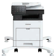
Main unit + Caster