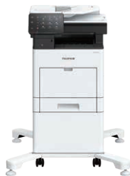
Main unit + Cabinet